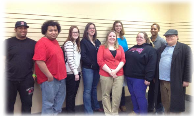
Mass. DMH Statewide Youth Advisory Council