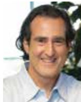
Governor Charlie Baker

“The UMMS research enterprise is at the forefront of a revolution in scientific discovery that is unlocking the power of the human genome to develop new and innovative therapies to treat disease.”