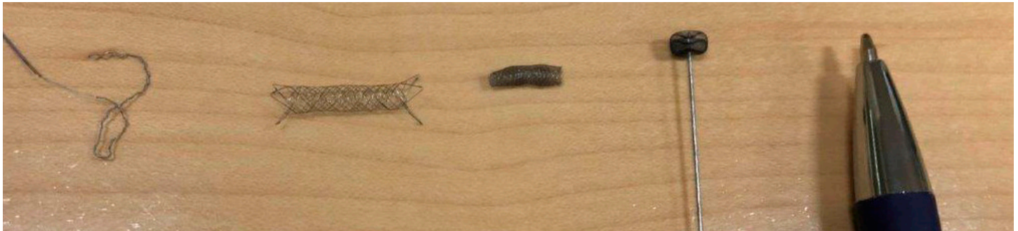
Super soft platinum coil