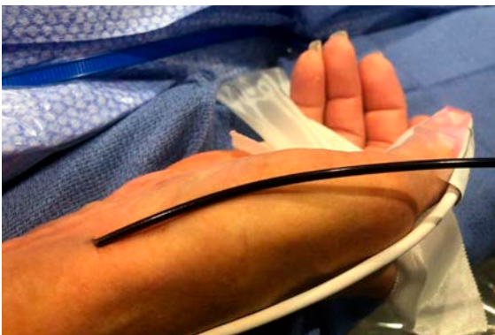
Radial artery access in the wrist

In addition to traditional groin access, the Neurointerventional Radiology Department is one of the world's leading centers for distal radial artery (artery of the "snuffbox" hand) access for minimally invasive brain interventions. We perform simple angiograms to complex neurointerventional procedures from the artery of the wrist or the artery of the hand. It is much safer and better for patient comfort than traditional arterial access sites. Our NIR physicians are leading teaching faculty for other specialties who are interested in learning about minimally invasive access options.