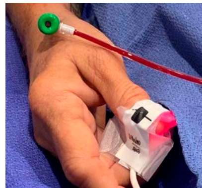
Distal radial artery in the hand region "snuffbox"