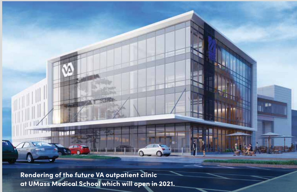
Rendering of the future VA outpatient clinic at UMass Medical School which will open in 2021.