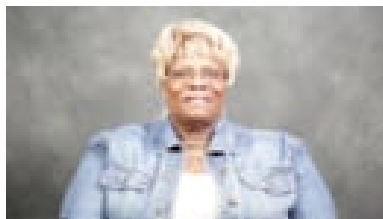
Watch Angela's Story

I would like to view stories about research participation