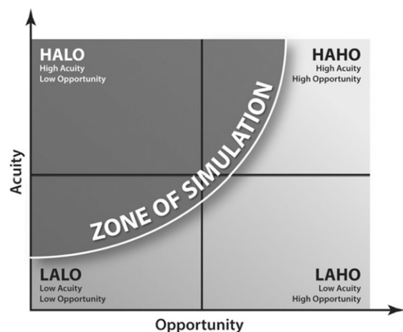
Figure 2. The zone of simulation matrix, reproduced with permission (Chiniara et al. 2013). Acuity is defined as the potential severity of an event or a series of events and their subsequent impact on the patient. Opportunity is defined as the frequency in which a particular department or individual is actively involved in the management of the event. The “zone of simulation” is that area in which simulation may be advantageous over other instructional media. Within this zone, simulation can serve as an acceptable substitute or complement to other, less expensive, media and methods. This matrix is a useful tool to educators for determining whether PS could be a suitable instructional method.

Simulation includes a wide range of educational experiences. It is thus important to select the right simulation option for the targeted competency domains or learning outcomes (Harden 2007). One conceptual framework, developed by the Canadian Network for Simulation in Healthcare, provides tables for the selection of media and simulation modalities (Chiniara et al. 2013). According to this framework, PS is best suited for training in techniques and procedures, along with their associated beliefs and attitudes, either through self-learning with motor practice, or through directed learning.