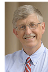
Dr. Francis S. Collins, NIH Director