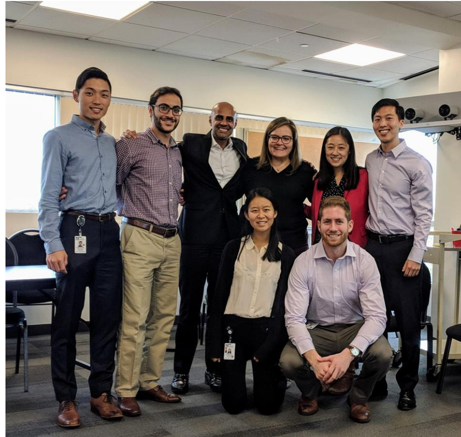
Doctors....and med students!