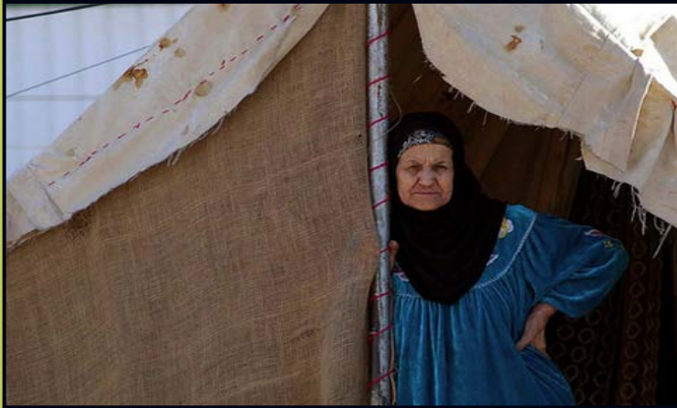
Al-Tanf refugee Camp