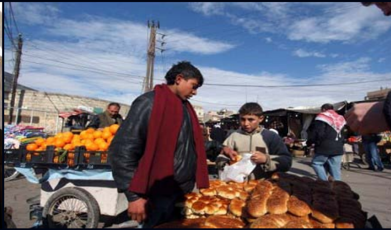
Iraqi refugees sell bread at a market in Damascus